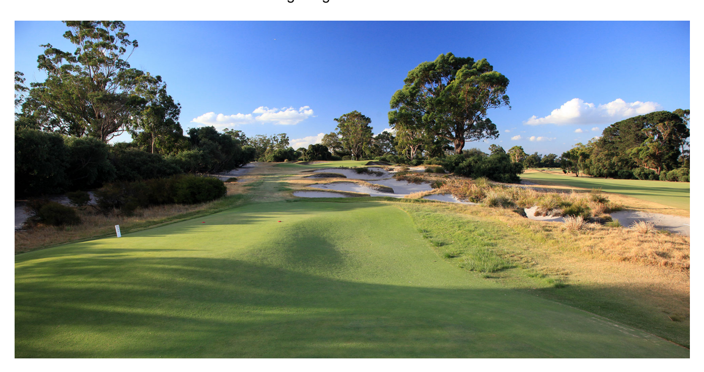
14 December 2020 to 18 December 2020

Play five games at four of Melbourne's prestigious Sandbelt Golf Courses, one of the world's best golfing destinations.