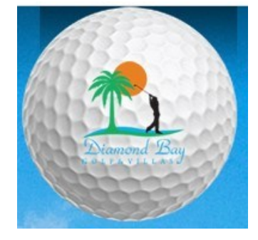
Phuc Đong,, Nha Trang, VT Viet Nam Region: Vietnam